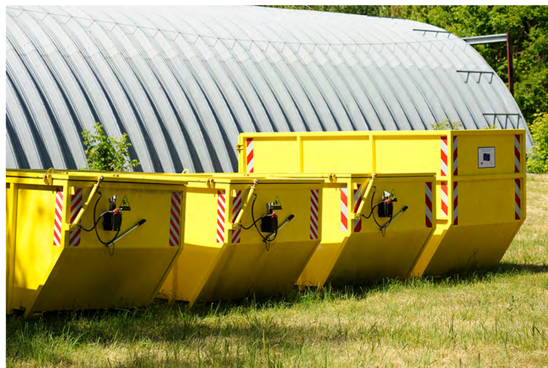
Example of surface-level nuclear waste disposal